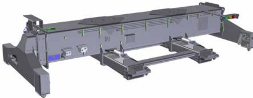
The picture shown is for illustration purpose and may not correspond to the final design.