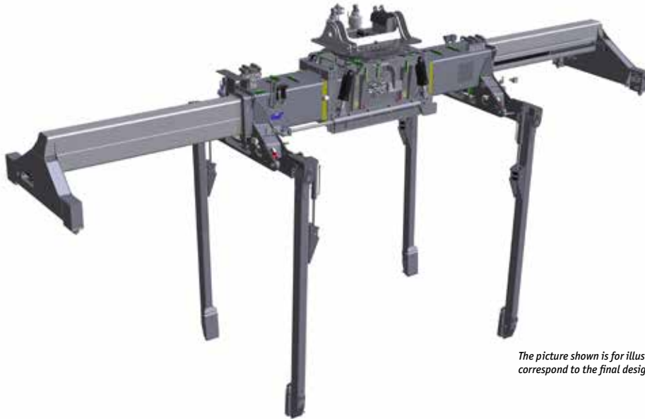
The picture shown is for illustration purpose and may not correspond to the final design.